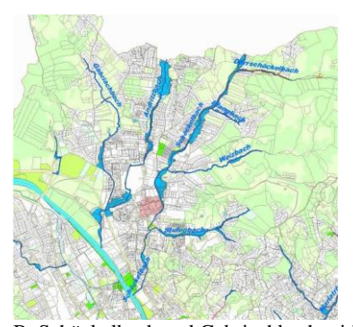
floodplains. https://docplayer.org/79587336-Das-sachprogramm- https://geodaten1.graz.at/WebOffice/synserver?projec

grazer-baeche-hochwasserschutz-fuer-die-stadt-graz- t=baeche ein-integraler-ansatz.html