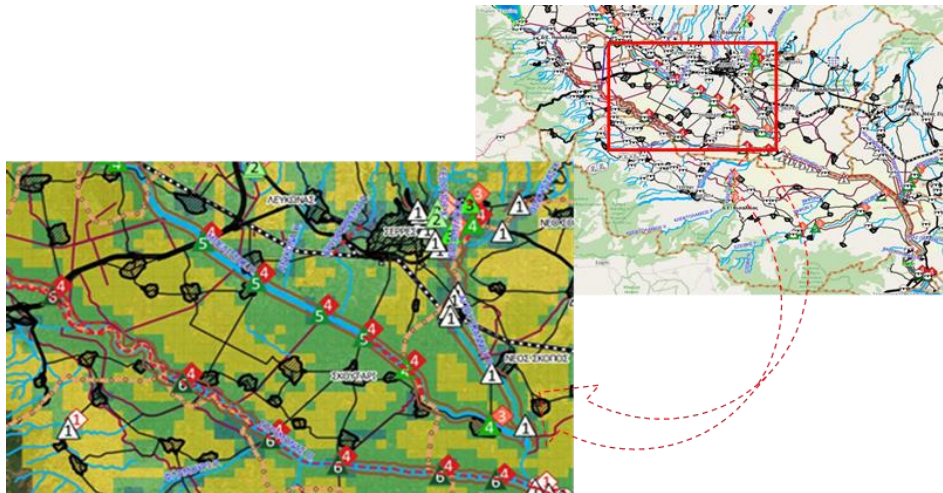
Fig. 2 Case study area as produced within the QGIS environment and zoom in regions with numerous flood protection works (e.g. red triangles and green squares attributes the works of the removal of deposits, and cleaning of bridges' piers from sediments).

The analysis of the data demonstrated the density of the anti-flood structures, i.e. in which way the structures are distributed within the basin and in which locations the majority of the structures is gathered, Figure 2. Moreover, the overlaying of the historic floods demonstrated the areas which are more flood prone, as well as depict the correlation between floods occurrence and the existence or not of flood protection constructions. The further analysis of the vulnerable areas to floods, i.e. the areas where floods phenomena are frequent, together with the locations and figures of flood protection works revealed the correlation between works and inundation occurrence.