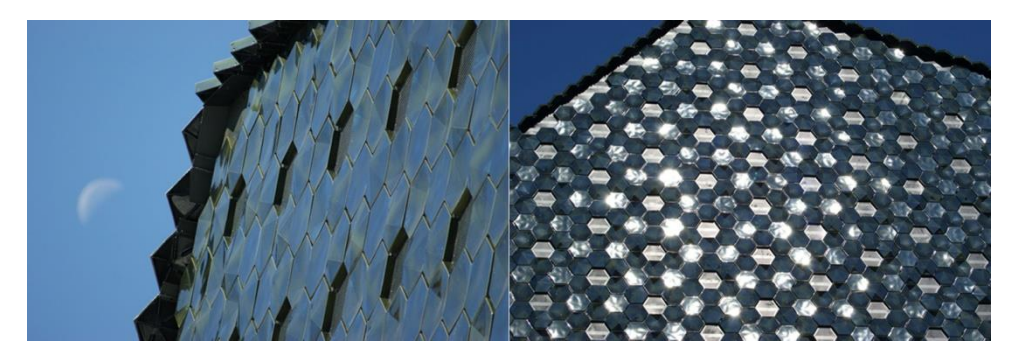
Fig. 2 Herzog & de Meuron has added a new roof to Basel's Museum der Kulturen, whose 3D tiles animate it, especially in strong sunlight. The steeply angled roof deliberately echoes the rooflines of the surrounding medieval buildings [12].

One tributary of the trend is a growing number of buildings with large-scale, matt or glossy ceramic facades. These inevitably recall such elaborately decorated Art Nouveau buildings as Antoni Gaudí's Casa Batlló with its iridescent roof, Paris's Ceramic Hotel with its glazed earthenware facade, courtesy of ceramicist Alexandre Bigot, and Villa Marie-Mirande in Brussels, which is cloaked with hand-made tiles provided by ceramicist Guillaume Janssens [12].