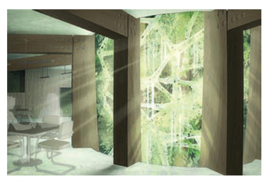
Fig. 10b Hydroponic Chandelier Loren Durkin, Adrian Lombardo, Zara Moon [14].