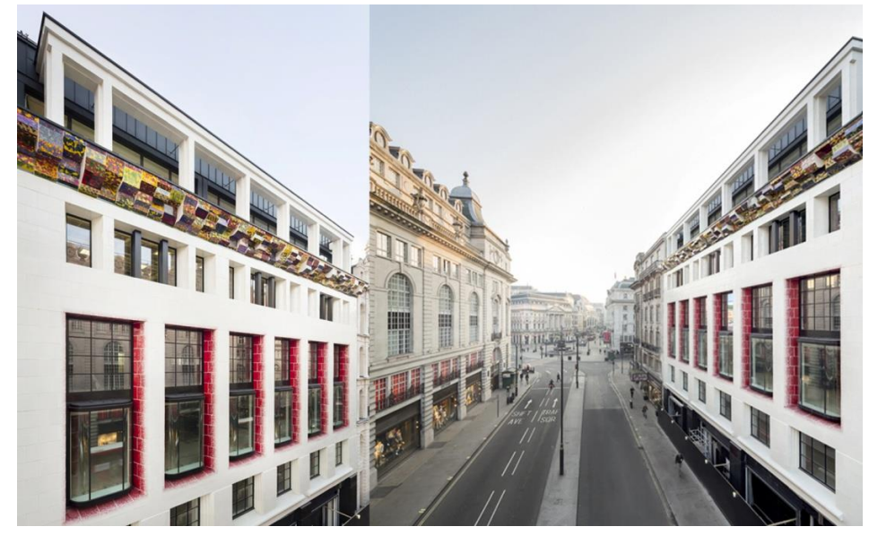
Fig. 3 The white faience facade fronting One Eagle Place, in London's Piccadilly, is adorned with a jazzy ceramic cornice by artist Richard Deacon and red window reveals; photos Dirk Lindner [12].