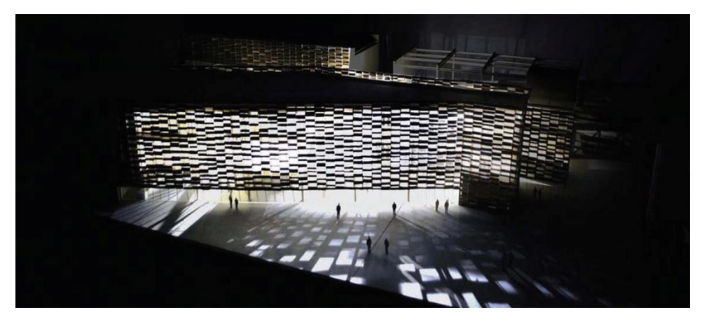
Fig. 8 Modular light-shelves David Parry, Jason Stewart, Katherine Strange[14]

of different coloured reflective glazes gives a more playful aesthetic to the facade, which breaks up what would otherwise be an expanse of curtain glazing. It also provides a colourful phenomenon in the interior of the building. Light studies have been produced to create a profile that allows for a powerful penetration of natural daylight figure 8. [14].