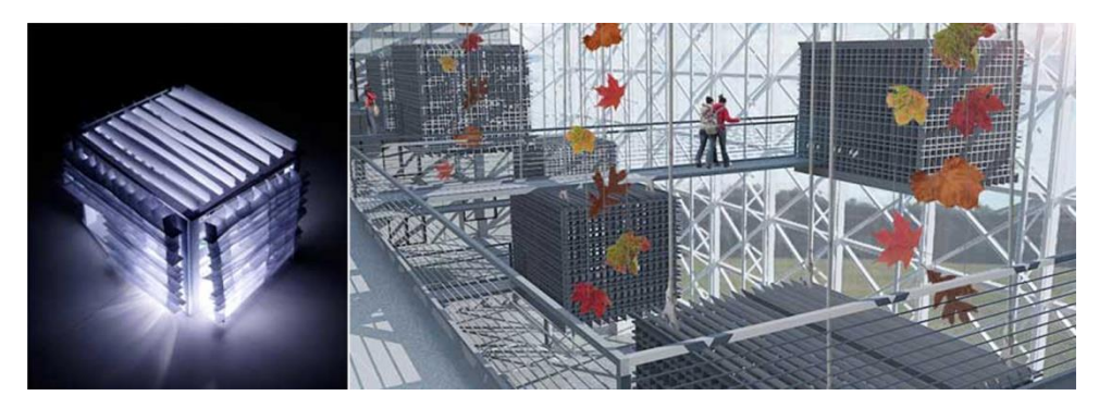
Fig. 9 Ceramic lanterns Amy Ellis-Taylor, Emma Smith, John Watling [14].

This project proposes the use of ceramic clad 'pods' hanging in the atrium space. These pods act as student 'break-out' spaces, for study or teaching. The ceramic louvres clad the whole envelope of these pods, and are backlit with an array of coloured LED's that filter and project the internal light towards the open environment of the atrium. The screened light here is used as a means to show occupancy as well as to provide a powerful articulated atrium with the image of the ceramic lanterns 'floating' in the space, figure 9.