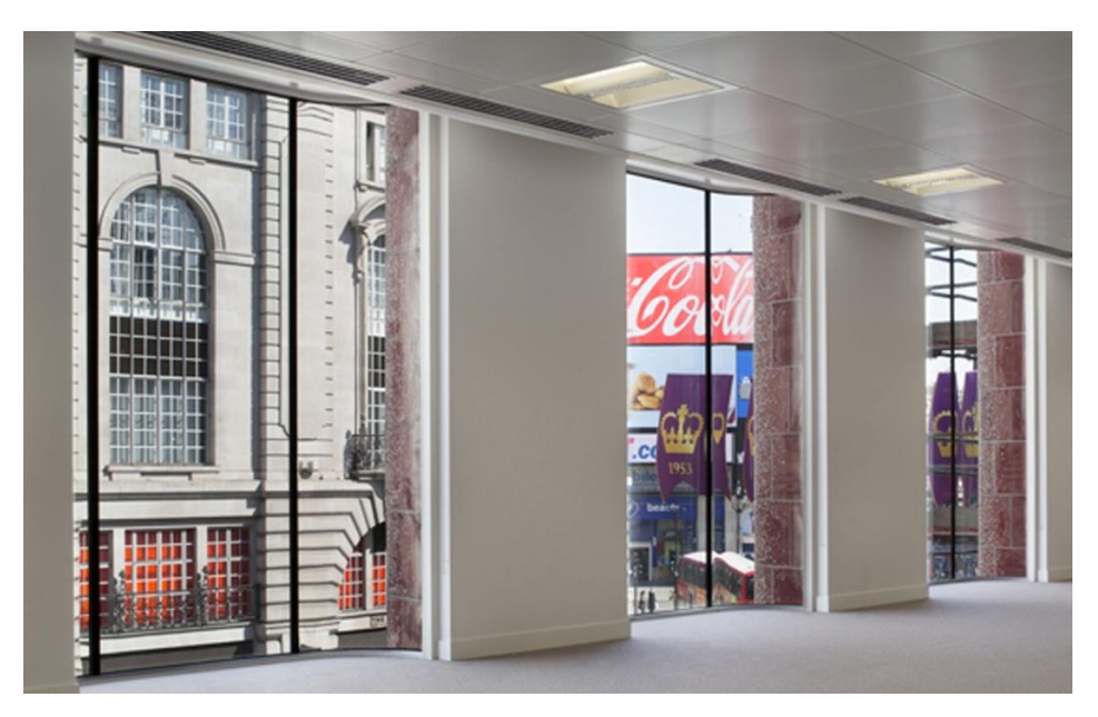
Fig. 4 One Eagle Place's interior overlooks Piccadilly's flickering LED signs. The idea is that the latter are reflected on the building's white faience facade; photo Dirk Lindner [12].