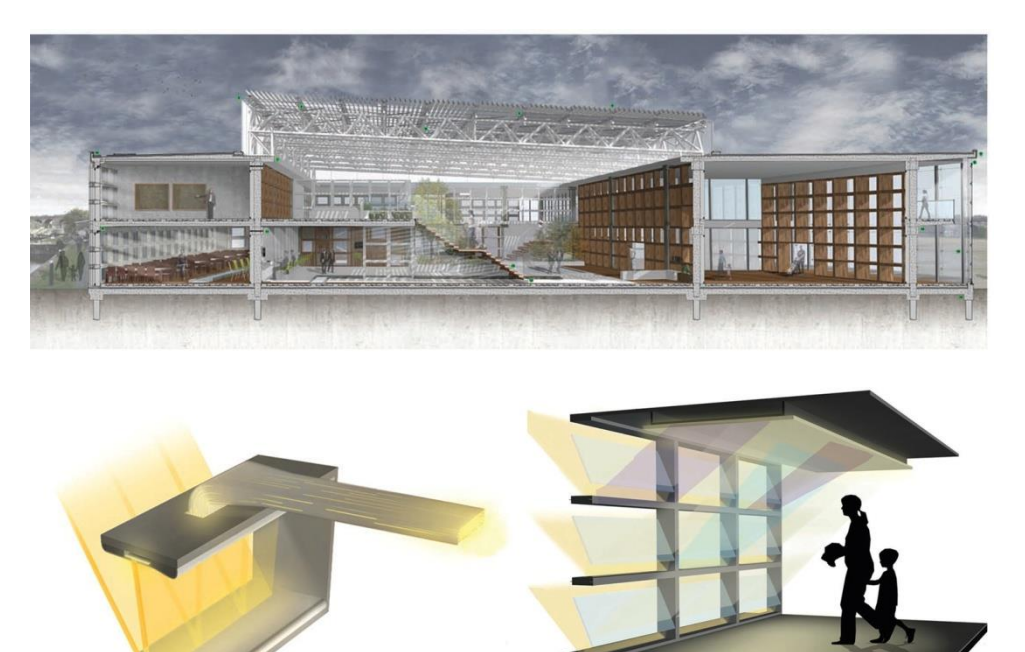
Fig. 12 Lighting surfaces Serena Cardozo, Ryan Jones, Li Yin Lim [14].