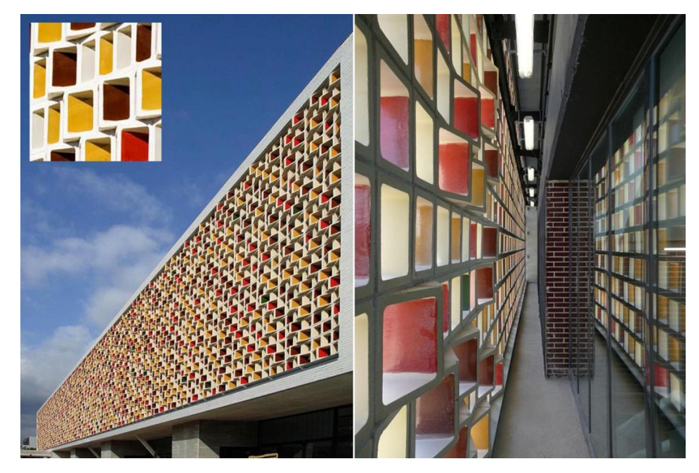
Fig. 5 One Eagle Place's interior overlooks Piccadilly's flickering LED signs. The idea is that the latter are reflected on the building's white faience facade; photo Dirk Lindner [12].

A passion for ceramics and craftsmanship is central to the workshop of Toni Cumella, a ceramicist who, between 1989 and 1992, helped restore Gaudi's Casa Battló and Parc Güell. Called Ceràmica Cumella and based near Barcelona, the workshop has also collaborated on many cutting-edge architectural projects, notably architects Enric Miralles and Benedetta Tagliabue's spectacular Santa Caterina food market of 2005 whose undulating roof is carpeted with 325,000 tiles. And Cumella has provided the ceramic lattice on two walls enveloping the CEIP primary school at Cornellà de