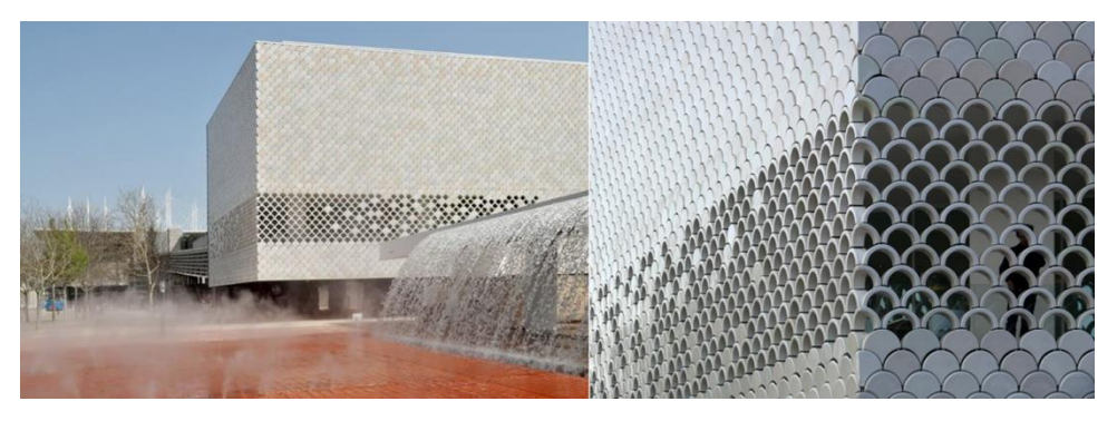
Fig. 6. Tiles in seven, subtle shades of white, also provided by Toni Cumella, clad a building designed by architect Pedro Campos Costa – a new addition to the existing Lisbon Oceanarium [12].

A passion for ceramics and craftsmanship is central to the workshop of Toni Cumella, a ceramicist who, between 1989 and 1992, helped restore Gaudi's Casa Battló and Parc Güell. Called Ceràmica Cumella and based near Barcelona, the workshop has also collaborated on many cutting-edge architectural projects, notably architects Enric Miralles and Benedetta Tagliabue's spectacular Santa Caterina food market of 2005 whose undulating roof is carpeted with 325,000 tiles. And Cumella has provided the ceramic lattice on two walls enveloping the CEIP primary school at Cornellà de