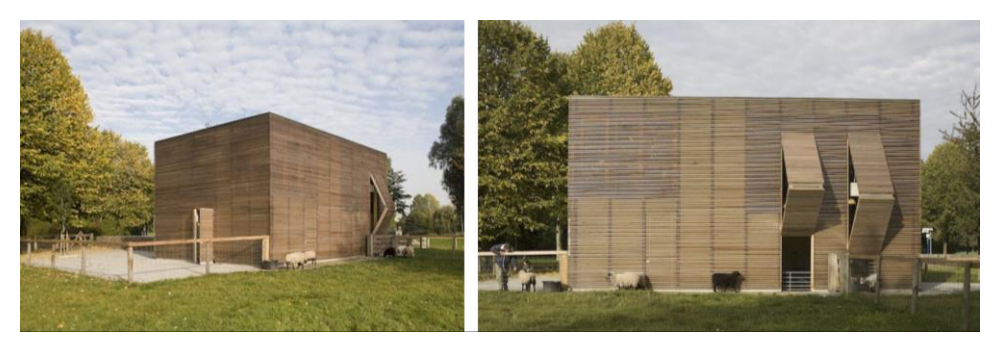
Fig. 9 Limit of visual aesthetics according to wood texture which applied

Half of the building is intended for animal accommodation and the rest is for other relevant uses. First floor includes double height space for animal accommodation and storage, while storage and offices are placed on the first floor. Building does not have conventional doors on the facade but has all necessary entrances. The compact form is the consequence of the openings mechanism, their visual treatment and position on the facade. Unconventional folding doors make different form experience when it is open or closed. When doors are closed, form implies to the limit of visual aesthetics (Fig. 9).