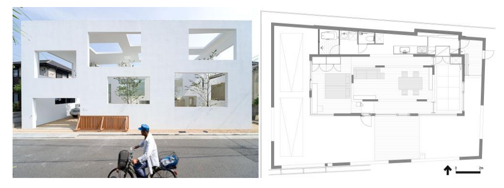
Fig. 4 Outer cubic shell; main floor plan: minimalist-fluid space

Building (Fig. 4) is created with three independent cubical shells placed one inside the other, which unify interior and exterior space. Rigid boundary between the street and the house is not defined. The outer shell shaped the courtyard and the parking area with vegetation, but on the other side the kitchen closed off with the transparent glass surface