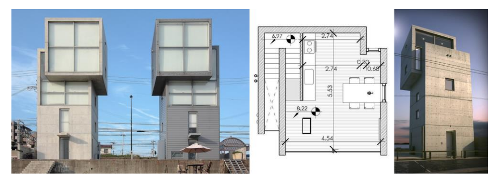
Fig. 3 Gate to the sea; third floor plan: minimalist function; entrance to the house

Project "4x4 House" (Fig. 3) is adapted very ably to the location requirements. By creating a couple of identical shapes the whole composition represents some kind of a gate to the sea expressed in the material contrast of wood and concrete. According to the architectural thought, hierarchy is a tool for expressing the form and establishing priorities according to their level of importance. The hierarchy is established by setting the highest to aside therefore this element has higher priority in design sense because this produces a visual illusion. This box on the top of the building actually looks higher and broader than the others. At the same time, the highest box is logical expression of starting with basic form. It represents as well the contrast which provides movement and asymmetry of the whole symmetric composition [21].