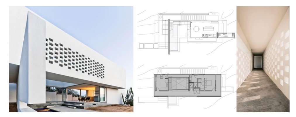
Fig. 6 Perforated main wall of cubic shell; main floor plan - first floor plan; light game