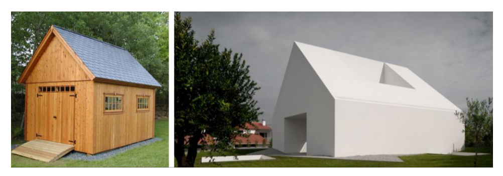
Fig. 1 Simple design and minimal design