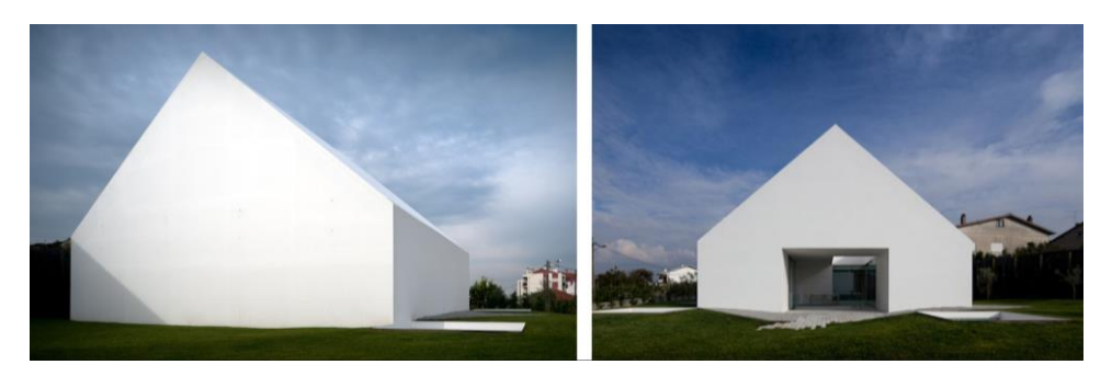
Fig. 2 House in Leiria, absolute minimalism - limit of visual aesthetics (Source: http://www.archdaily.com/118906/house-in-leiria-aires-mateus)

Brothers Manuel and Francisco Aires Mateus achieved almost perfect archetypal house shape with this project, reduced to a complete minimum. The main part of the house is the central space running through the three-floor elevation which shapes and refract light. Atrium walls are materialized with glass through entire height in order to get better lighting performance. Unconventional, final surface treatment is provided by painted mortar created by special waterproof material. Other than usual, this material does not need additional maintenance, only periodical paint job. Interior and exterior are interwoven with each other so that clear boundary between these two aspects cannot be defined (Fig. 2).