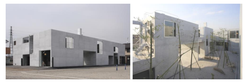
Fig. 8 Cubic form is opened with rectangular gaps; atrium space

This building should be observed as a small city, created with a singular household. This is in many cases typical to Japan. Author's unique perception of architecture and city implies understanding of private and public space interaction, so that urban life enters into a private, residential and reflects the external world. The form completely follows this perception and with its full and empty parts the facade represents both private and public space respectively. Every residential unit has a roof terrace. The atrium space includes a bamboo garden which represents a common public space and this space has a role as some kind of sanctuary. Every apartment has a window looking onto a garden and this invites inhabitants to that part of space which belongs to no one and everyone at the same time (Fig. 8).