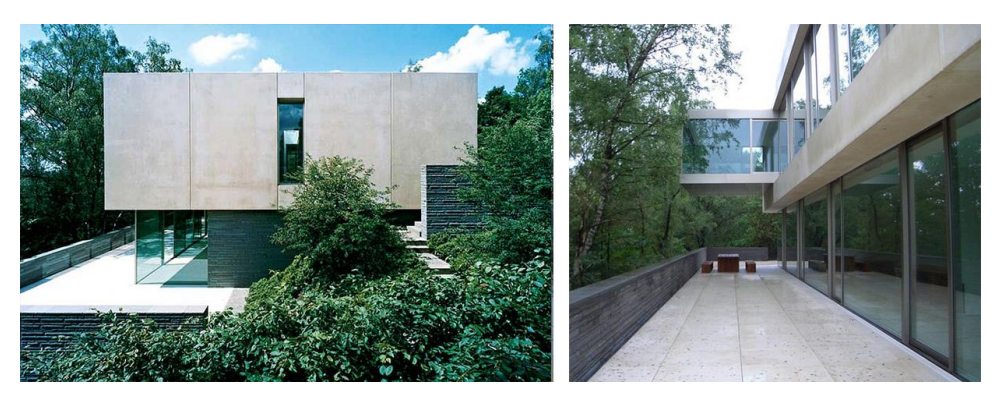
Fig. 5 House in Germany, Nordrhein-Westfalen - reduced cubic form

The design of the family house in Germany (Fig. 5) as two-level building, includes one completely open floor, while the other is half-underground. Terrain slopes from the street direction which produces one-level effect. One of the article headings of John Pawson's house project was "simplicity and complexity" and this affirms Donald Judd's definition of minimalism: "Minimalism is simple expression of comprehensive thought". Pawson's work is described as minimalistic and their perception is an attempt to change everything, until now. According to Pawson, the idea of minimalism is to eliminate mess of everyday life. He actually claims that by removing the mess, we can find satisfaction in everyday life [5].