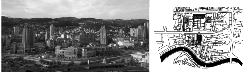
Figs. 1, 2 Megdan after reconstruction

The characteristics of Timotijević's designs which more obviously relate to the concept of critical regionalism are, on the one hand, his permanent concern for what he calls location building, i.e., place building, and on the other, his conviction that restraint and moderation are beautiful, which is why he gives priority to tectonic and visual formation. The play of light and shadow has an important role in the overall concept. Also, Timotijević has an extraordinary capability to enrich his shapes with craftsman's touches. In order to inspect all these elements more closely, i.e. to exemplify how the principles of critical regionalism are employed in Timotijević's work, several mixed-use buildings in the Megdan neighborhood are analyzed below.