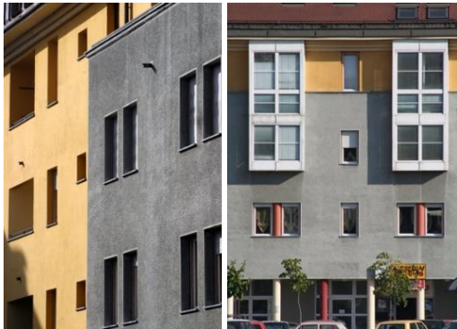
Figs. 15, 16 Pure and plain-looking facades of mixed-use buildings (1993-1994)