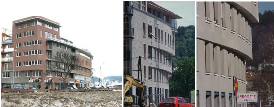
Figs. 9, 10, 11 Mixed-use buildings in Omladinska Street

The mixed-use facilities in Omladinska Street, which overlook the river, are particularly interesting thanks to their convex frontages extending along the riverfront, also parallel with the convex bank revetment just below the street. The proximity of the bank revetment and the almost exact convex shape of the building give the street surface and the sloping stone bank the appearance of a solid base that the new buildings stand on (Timotijević, 2004:42). This combination of elements creates the effect of a natural, symbiotic relationship between the natural and man-made environments (Figs. 9, 10, 11).