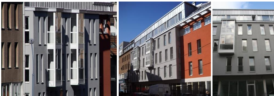
Figs. 12, 13, 14 Mixed-use facility built in 2009

Even though the individual Megdan buildings were erected over a relatively long time span, the architect strictly stuck to and insisted on the cube shape for all of these office and residential buildings, with the effect of their forming a continuous series of blocks. The latest addition to the development, the building constructed in 2009, reveals the same solution that choosing to continue using the forms found on the spot. Simple window openings are still the most prominent elements on the main frontage, although their arrangement is now slightly more “playful” compared to those built previously (Figs. 12, 13, 14).