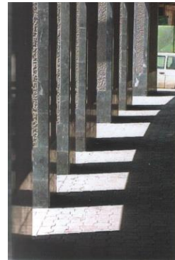
Fig. 17 Light and shadow as architectural materials