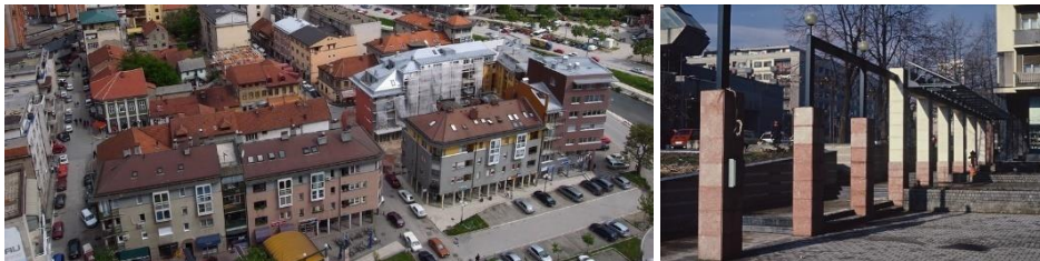
Figs. 3, 4 Megdan, mixed-use buildings, with small stepped plaza

The office and residential buildings constructed first (1993-1994 5 ) are of great importance, as they line the city square, a small plaza and a strip mall. Beside the ground-floor colonnades in these buildings, the colonnades, eaves and canopies of the small stepped plaza are the elements that shape the public space, subtly connecting the new block with the existing structures and Partizan Square (Figs.3, 4).