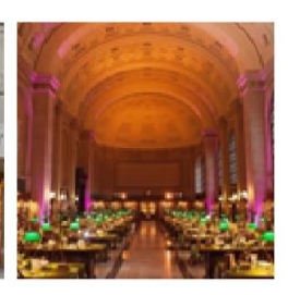
Fig. 2 Renovated Boston Public Library, 2015) Exterior view [13], b) Entrance to the Johnson Building [14], c) Renovated Interior View, Battes Hall Reading Room [15]