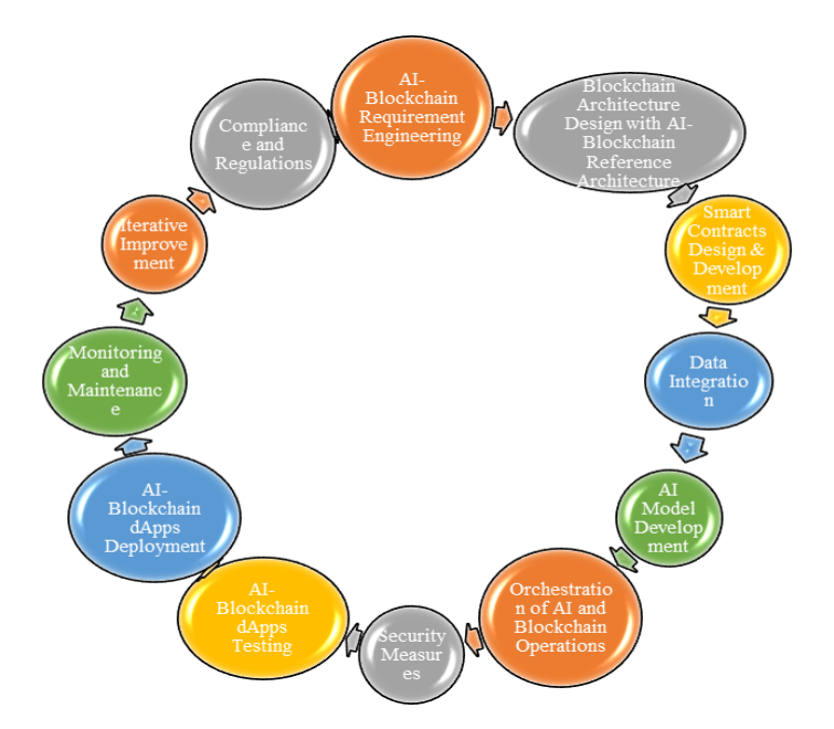
Fig. 3 AI-BlockchainOps Development Process

These smart contracts serve as foundational elements, customizable and combinable to cater to the diverse needs of healthcare organizations and patients alike. By adopting AI-BlockchainOps development process, we can standardize the applications in healthcare for safety, security & sustainability as follows, and the process is shown in Figure 3.