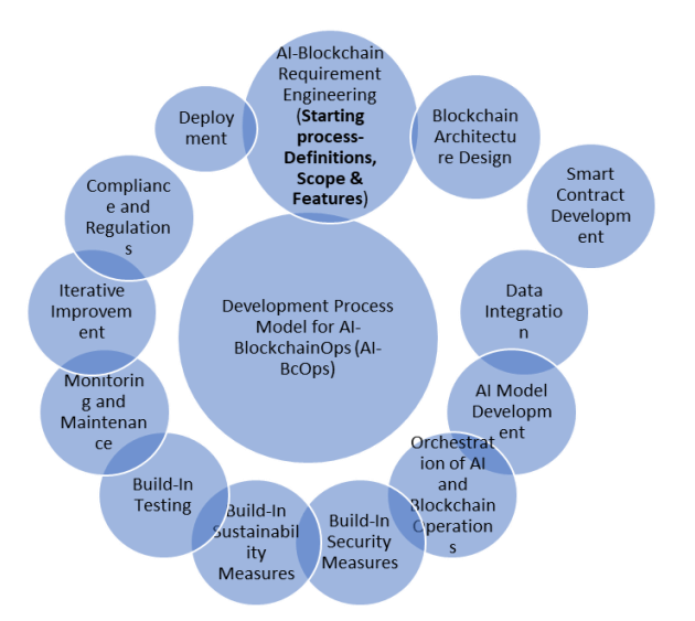
Fig. 2 Development Process Model for AI-BlockchainOps (AI-BcOps)

AI and blockchain can deliver secure, sustainable, and reusable applications in healthcare where the success of the AI in terms of its prediction models and the success of the blockchain in terms of its smart contract can be merged to benefit each other. Therefore, this article introduces the notion of AI-BlockchainOps (AI-BcOps) that outlines the integration of artificial intelligence (AI) and blockchain operations. This section provides a conceptual framework that organizations might follow when integrating AI and blockchain technologies into their operations. This framework would involve aspects of both AI operations (AI Ops) and blockchain and IoT (BIOps) operations. This is shown in Figure 2.