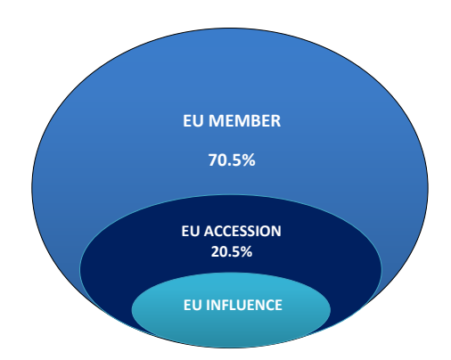
Fig. 1 Review of Literature by Type of Country

Perhaps the most interesting insight is that 70% of the sources focused on the informal sector in countries that are currently members of the European Union, as opposed to countries seeking to join the EU. Informal recyclers and re-use operators exist in Europe, and are a part of the landscape of recycling and re-use within the European Union, and there is therefore little to be gained by denying their existence.