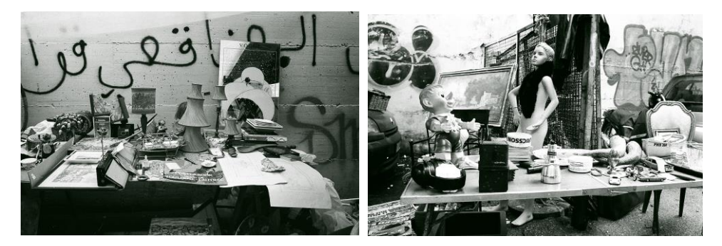
Photo image 3 Porta Portese Flea Market: detail. Photo credit Sebastiano Lauro

Source: Elaborated by the authors based in part on information from Occhio di Riciclone and Associazione Operatori Porta Portese (2006), Luppi and Sole (2015), Occhio di Riciclone (2008), (2015), Rome City Council (2005), Carabellese et al. (2013), Occhio di Riciclone (2009), Battisti et al. (2013).