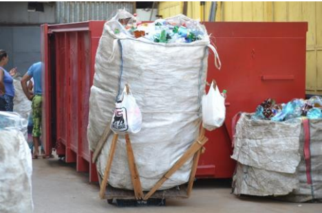
Photo image 1 People queuing up at the recycling centre to valorise their work. 8-9 am is the peak at the scrap yard, since people start collecting early in the morning and also bring the materials collected the previous day.