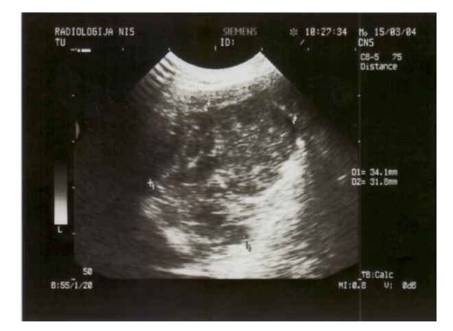
Fig. 1 Inhomogeneous, ill-defined, ultrasound appearance of ES of scapula (Case 1) measuring 34 x 31 mm.

patient was prepared and operated on. Resection of tumor along with the whole acromion and part of the scapula was performed with wide margins. Resected tumor measured 7 x 4 x 3.5 cm. On histology tumor was composed of small dense uniform round cells with round nuclei and scarce cytoplasm and the histopathology diagnosis was Ewing's sarcoma. Chest x-ray and CT scan didn't show pulmonary metastasis. The patient was then referred to the national oncology center where he received multimodal adjuvant chemotherapy. He was doing well for three years postoperatively. Then pulmonary metastases have been detected and he succumbed four years after surgery.