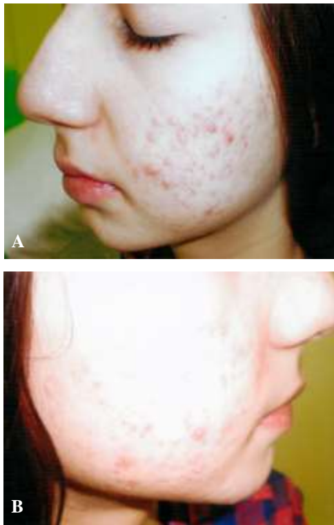
Fig. 2 A – At the beginning of the treatment, B – After 2 months