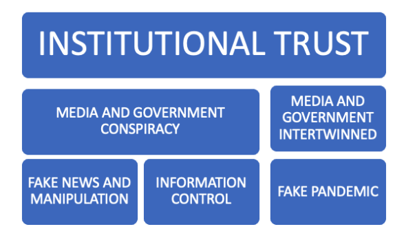
Fig. 3 A Final Thematic Analysis - Index.hr & 24sata

to various nicknames and names left in the comments. The more diverse themes that appear from comments are indeed fake news and manipulation of the media and questioning of the pandemic including the vaccine. Therefore, the final thematic analysis excludes far-right content. It appears that the Croatian public enforces conspiracy theories and challenges the media and Government as untrustworthy, seeing them as manipulating and spreading fake news about the pandemic to control information about the pandemic being fake (figure 3).