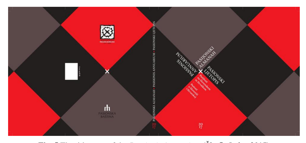
Fig. 5 The title page of the Passionis Annuarium (Škofja Loka, 2017)

It is true then all of installations and by the own attitude of images, the pictures in the whole 13 (numbers) are kept in all these examples only by continuance numbers of images and its titles, if not other. For both or all of the "music" works is important to notice the harshness, which is the same in all of them: sad, gloomy as from this text we expect. (The original) text of the ŠLPP refers to the number of musical instruments and the musicians, the playing (instruments) and singing. In all the further performances the ŠLPP as a static (dramatic), the procession and/or the radiophone performances is the same, therefore the music, announces each time differently.