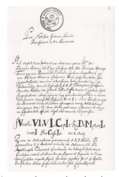
Fig. 2 The title page – the second numbered page of the ŠLPP, the dramatic text from the year 1721