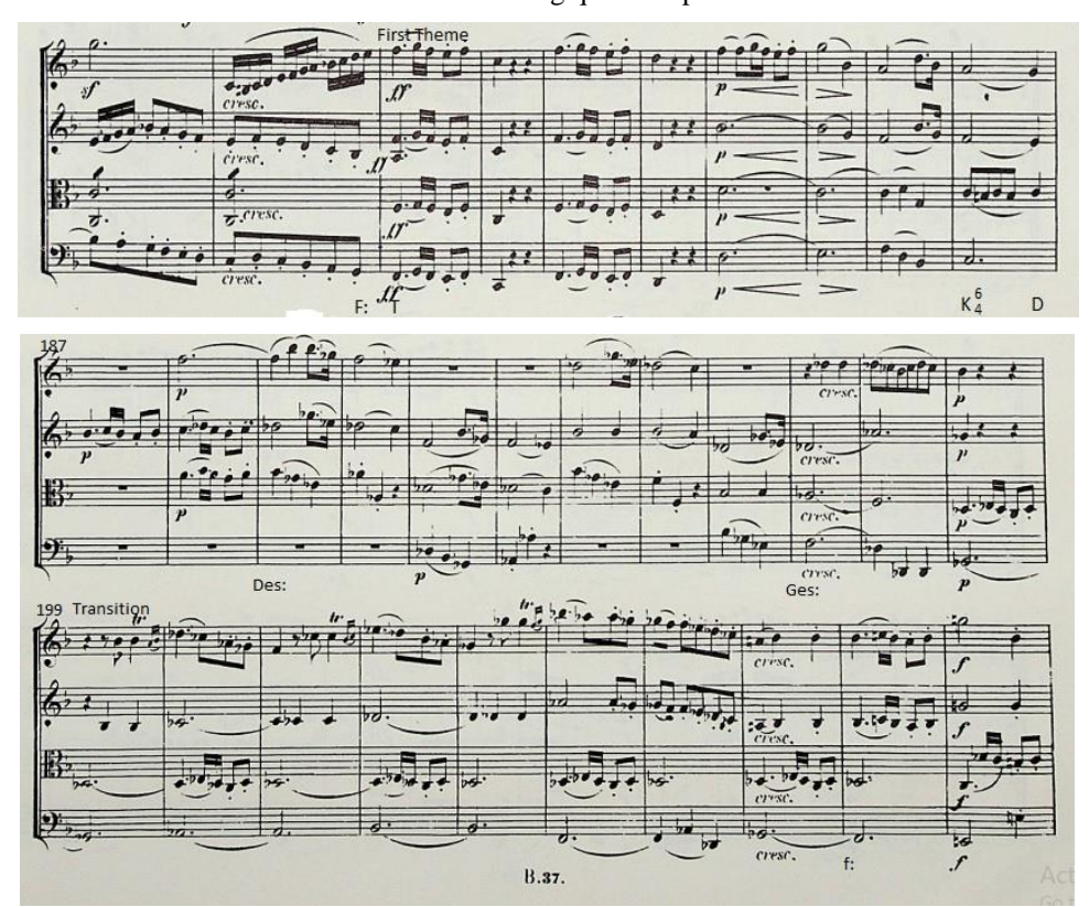
Ex. 5 Beethoven: String quartet Op. 18 No. 1

viola. Thus the musical course acquires agility, dynamism which was not typical for the exposition and the sonata form as a whole acquires completely specific traits.