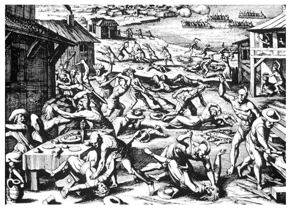
Fig. 4 The 1622 Massacre of Virginia Settlers, Matthaeus Merian, 1628 (Public Domain)