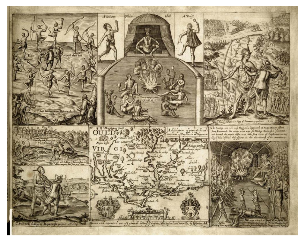
Fig. 3 Ould Virginia A Description of Part of the Adventures of Cap. Smith in Virginia, Robert Vaughan, 1624 (Public Domain)

The scene of Smith's alleged rescue by Pocahontas (the third figure at the bottom) is even more frightful and claustrophobic. Captain Smith is clearly represented as an innocent victim of fearful savages, bound and helpless, tiny and insignificant compared to the figure of Chief Powhatan who is, significantly, seated by the hellish fire. Only the figure of Pocahontas is tinier than Captain Smith which is supposed to emphasize her bravery, but also the savagery of her fellow tribesmen. The European colonizer is in the position of the victim, whereas the power of the Powhatan tribe, at the time of the publication of Smith's book still very solid, is epitomized in the powerful figures of ferocious savages. The fact that there are so many natives and Smith is helpless and completely at their mercy also perpetuates the ignoble savage stereotype.