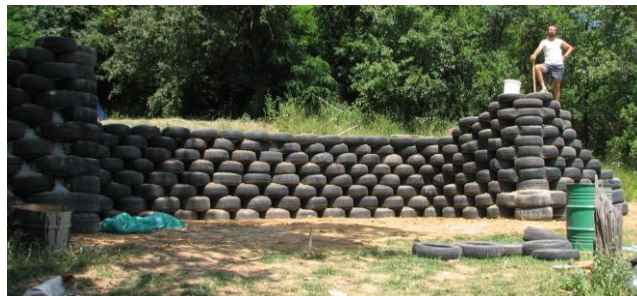
Fig. 6 ‘U module’ of an earthship in construction, Brusnica, Serbia (image courtesy of S. Ignjatović and Earthship-Serbia, 2012).