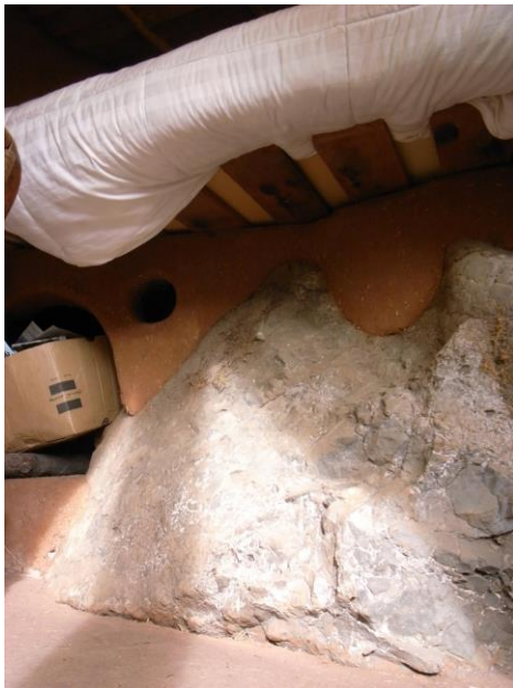
Fig. 2 Bedrock house (designed and built by Cob Cottage Company and apprentices) integrates existing bedrock in its architecture; North American School of Natural Building, Coquille, Oregon.