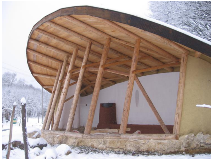
Fig. 8 Experimental and exhibitory building in Prijakovci, Banja Luka, Bosnia and Herzegovina. Picture displays general structure and combination of load bearing wall and timber frame - before completion with glazing on the southern façade.

The building plan is comprised of two semi-ellipses (with outer perimeter axes of 9 and 4,5 meters). Foundations of compacted river-gravel support stem wall constructed of stone laid in lime mortar. Load bearing walls (one curvilinear continuous wall) include cob (in ratios of sand to clay soil of 3:1 and triticale straw ‘to taste’ [60] and cob combined with straw-bales (‘bale-cob’ [61]). Smaller infill elements were constructed in technique of light clay straw [62] and sand-clay-straw renders include 1/3 cow dung. Southern wall (completely glazed) employs a round-wood timber frame made of spruce ( Picea abies ) and protected with pine-tar. Extensive green roof (with mostly Sedum and Sempervivum species currently establishing in 5 cm of local soil) rests on low-cost (although robust) HDPE membrane.