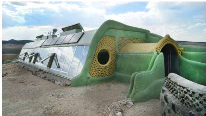
Fig. 7 An earthship, built according to ‘Earthship Global Model’, Taos, New Mexico

Being positioned through a set of mostly technical determinants, the concept of earthship translates into corresponding technology-accentuated visual appearance. Passive solar design elements determine the general volume (visual orientation, angles etc.) and its relation to surrounding landscape (earth embankments and dug-ins). Onto such background, specific technologies (photovoltaic panels, wind turbines, solar septic tanks and ventilation roof openings) are applied as visual elements, defining the silhouette. As a third visual layer, an assemblage emerges consisting of integrated garden beds, reused cans and bottles, colour-pigmented walls, ready-made sculptures and other (intentional) signs of amateur and communal building process (Fig. 7).