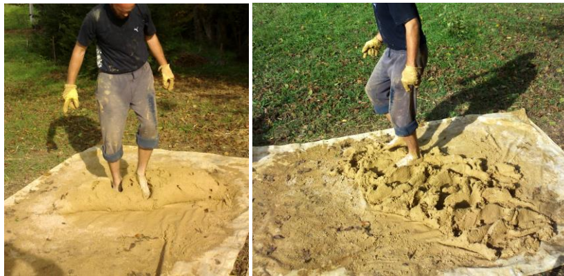
Fig. 5a,5b Mixing cob by feet (image courtesy of M. Šukalo 2012).