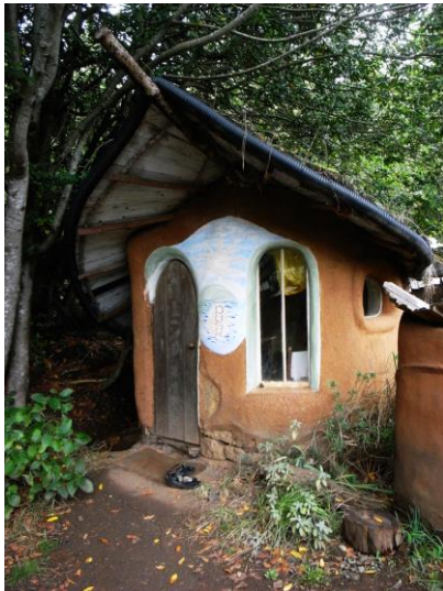
Fig. 3 Dusk house (Cob Cottage Company and apprentices; North American School of Natural Building, Coquille, Oregon): a typical exhibitory small building with varying intensity and regime of use (source, B. Liloia, under a CC-BY 2.0 license, 2009 [45]).