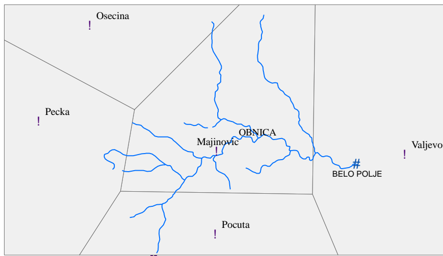
Fig. 2 The Obnica River basin with hydrological station (blue triangle), rain gauges (violet dots) and Thiessen polygons for the rain gauges

The rainfall-runoff model for the Obnica River basin, shown in Fig. 2, is developed in HEC-HMS software as the lumped model. The basin is a typical mountainous basin with an area of 185 km 2 . The flow is measured at hydrological station Belo Polje at the catchment outlet. As described in section 2, Snyder's SUH is selected for direct runoff computation and rainfall excess is assessed applying the SCS-CN method. Base flow is modelled by the recession method.