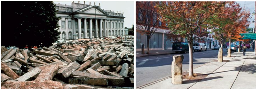
Fig. 2 Joseph Beuys, 7 000 Oaks , 1982

Here one can see a surprising parallel to Joseph Beuys's (1921-1986) art installation of 7 000 Oaks (1982, carried out for the exhibition Documenta 7 (Kassel, Germany), based on the social application of the creative process, that is on the idea of 'social sculpture' – the term that Beuys coined in the 1960s and 1970s. Installation of 7 000 Oaks was designed as an attempt of healing the deep psychic scars of the Third Reich and helping the renovation of German, European and Western culture. In the giant plaza at the city's center of Kassel, Beuys piled 7 000 irregular, human-sized columns of gray basalt (poured igneous rock) in a formation, exactly as thousands of bodies were piled after the bombing of Kassel in the 1943. Over the next five years, donors purchased the stones one by one. As each stone was purchased, it was moved to a different location in the heart of the city near the street, where it was placed upright, sticking at least a meter out of the ground. Next to each stone the oak saplings were planted. While the form of the stone-pillar would have remained static, the form of the oak tree would have changed and grow over time, moving from the dwarf phase, across the forms of the pillar size to eventually the form of a giant, the form that greatly exceeds the height of the pillar [5, p.2].