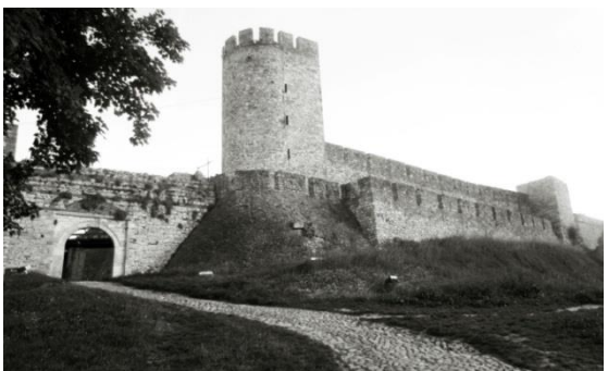
Fig. 3 Zindan Gate.