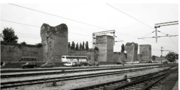
Fig. 5 Citadel – "Lower town" (Photo: Lečić, 2016).