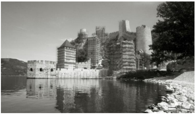
Fig. 7 The main gate of theouter fortification (Photo: Lečić, 2016).