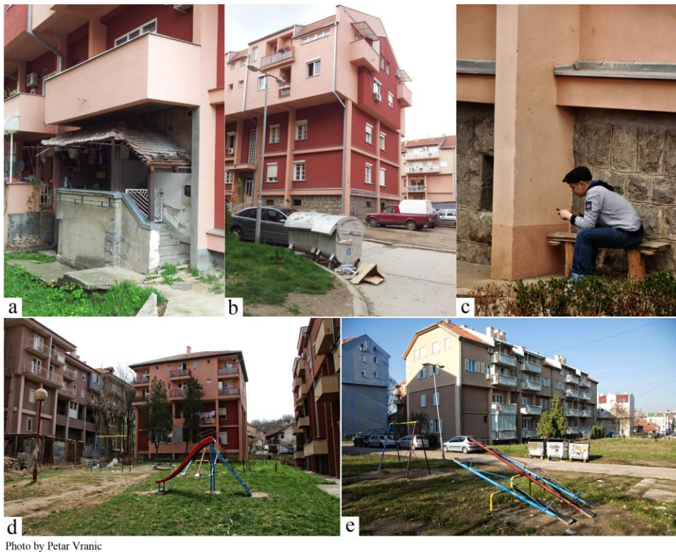
Fig. 4 The neighborhood of SZK after MSE

by chains and iron triangles. Without control and sanction for such a behavior, as interviews point out, this trend just increased in scale, scaling down usable open space and fueling tension among the residents. On the other hand, much of the rustic greenery planted along the street was destroyed during the construction work, which prominently decreased the environmental quality in the neighborhood. Additionally, the scaffolding and construction materials left over in the area attached to yet unfinished buildings (see Fig. 4d), and insufficient numbers and consequently overloaded waste containers, with the lack of adequate protection, decreased the environmental quality, safety and use (play) comfort of the public open space.