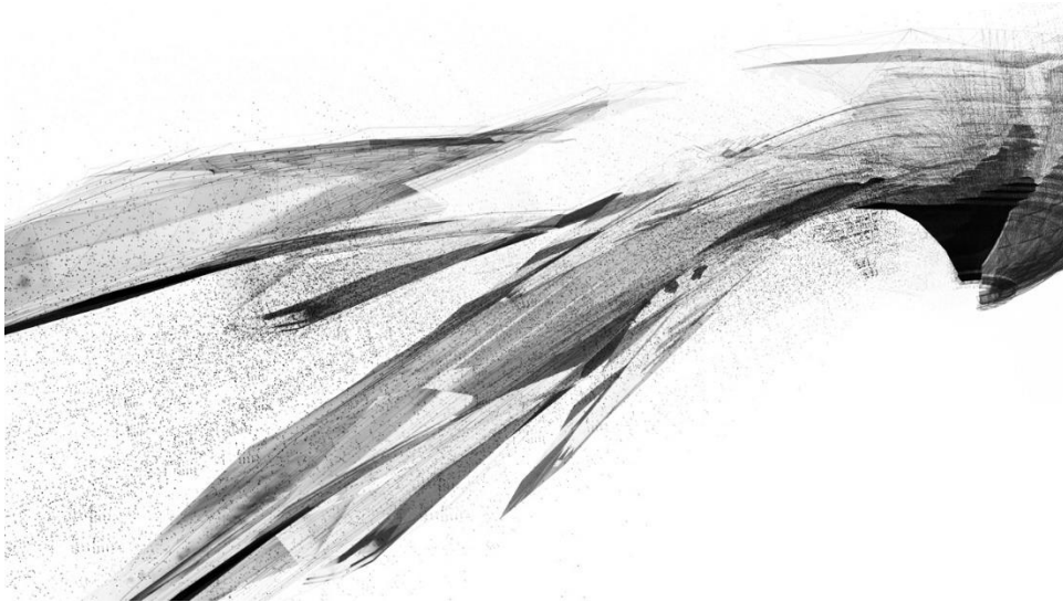
Fig. 3 Fragment 00038944 Complete in its incompleteness, M. Mojsilovic & F. Prica, Digital model, 2018.12:11.19:45

spatiality of the appearance of matter (its actualization), both the subject and the context in which it appears. Massumi sees digitization and the topological paradigm as a neo-modernism, characterized by Deleuze's fold to infinity , as well as an extended field of fluidity of form, identity, even the entire discourse. Transition to the virtual structures the form, although it is non-formal conceptually (but also formally), it is more a state within transition, a moment of transition and the intersection of change. Even though the virtual cannot be seen or felt, it cannot not be seen or felt as other than what it is (Massumi, 1998).