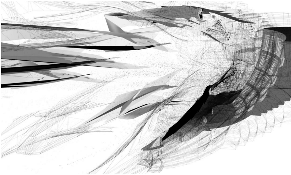
Fig. 4 Fragment 00038975 Neither Beginning nor the End, M. Mojsilovic & F. Prica, Digital model, 2018.19:11.21:36

The condition for the emergence of the formless ( informe ) is the intensification of space that breaks with the intervals of articulated elements of the limited space and the traditional place in which it occurs as free and exceeds the framing of place, plan and programme (Rajchman, 1998). It is a matter of shifting the centre of gravity with a constant movement, motion and disappearance, in folding and folds of forms that capture the void. Multiplicity is the idea of endless folding, or endless becoming and its elusive nature that is in constant motion.