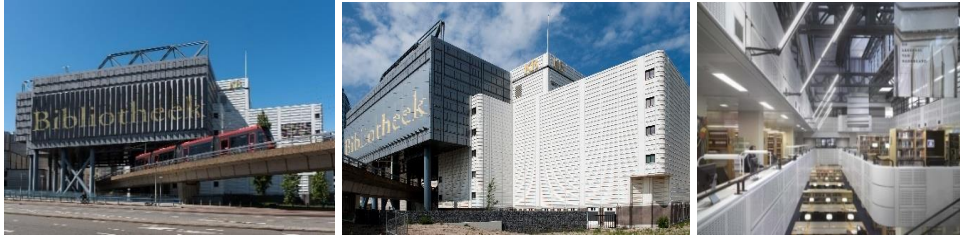
Fig. 3 National Library of the Netherlands- a) a view of the main building [16], b) a view of the exterior of the library, viewed from the “Prince Bernard” viaduct [17], c) a view of the renovated interior [18]

In addition to these transformations, by equipping the interior with modern equipment and introducing information technology, the National Library of the Netherlands is beginning to support e-Depot, that is, a new model of electronic depository system.