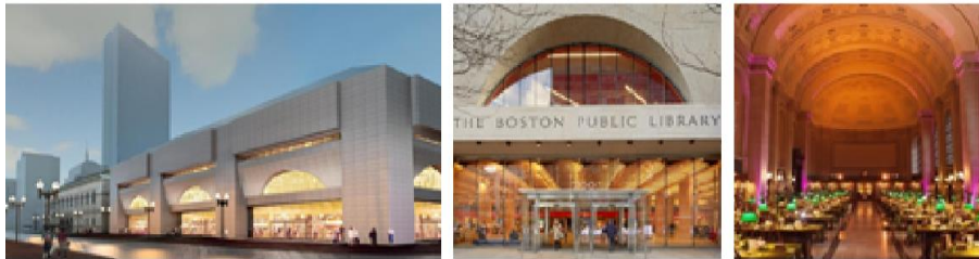
Fig. 2 Renovated Boston Public Library, 2015) Exterior view [13], b) Entrance to the Johnson Building [14], c) Renovated Interior View, Battes Hall Reading Room [15]

As a result of these works, a new space was provided for "400,000 books on open shelves and a conference space for 2000 people. The open shelves system increased the number of books in the library by 75% in the first two months." [12] In addition, the revitalization process also included analysis of daylight, ambient lighting and special desktops lighting to meet a wide range of user reading needs. (Figure 2). The overall result is a space that is comfortable and provides a range of study conditions to meet the needs of Boston library visitors.