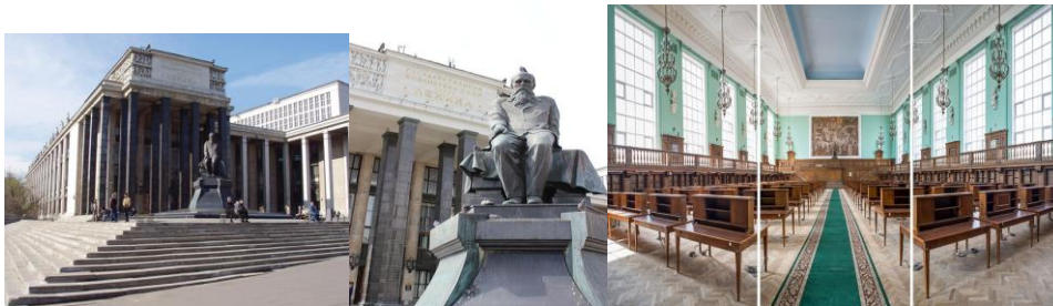
Fig. 5 State Library of Russia- a) Exterior view [21], b) Parterre design- Dostoevsky statue [22], c) Interior layout of the structure [23]

Given that the National Library's collection of books has grown so much over time, the library's premises have become scarce, and during the 20 th century a second building was built next to the museum, which by its volume had to meet the demands of new space capacities. However, this solution was not adequate either, since, in the case of the Russian State Library, “to maintain inventories, by the standards, it is necessary to own not less than 110,000 square meters, and the library has only 60 percent of this space available.” [20]