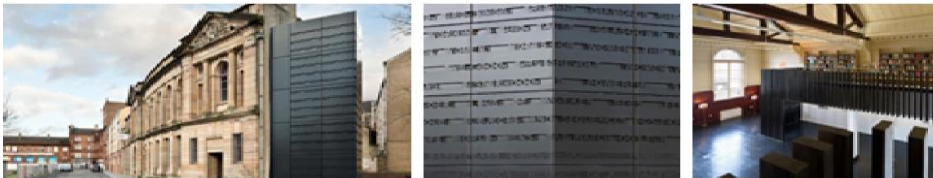
Fig. 4 Glasgow Women's Library, Scotland - a) Exterior view of the building after revitalization b) Facade detail, c) Interior view after revitalization [19]

As part of the interventions in the exterior of the building, stone carvings, decorative fence details and engraved inscriptions were restored. On the south facade, a new elevator structure was built, lined with dark steel panels, into which were inscribed literary works (Figure 4).