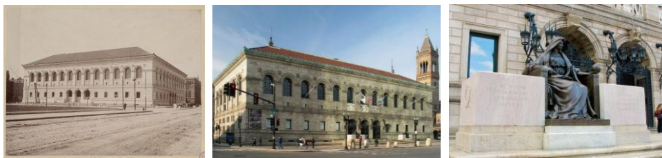
Fig. 1 Boston Public Library a) Old layout of the library [9], b) Renovated library, 2005 [10], c) Detail of "Bella Pratta" statue [11]

In addition to the careful reconstruction of the facades of the building (Figure 1), the existing landscape and site characteristics of specific external features, such as a courtyard arcade, a courtyard, including fountains, plants, paving, etc., are largely preserved. Also, new additions / changes to the site (such as the ramp for people with disabilities) have been designed to be unobtrusive and preserve all the original features of the site.