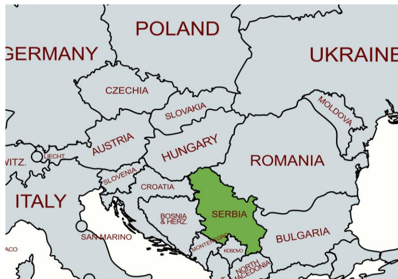
Fig. 1 Map of research area