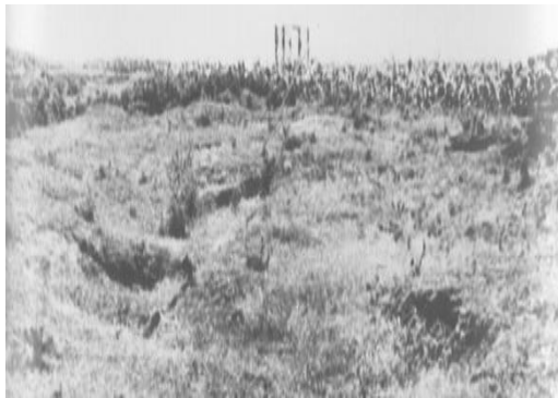
Fig. 4 Bubanj shooting and burial grounds (Feb. 1945): Footage of the Commission for War Crimes, Pits and trenches where victims were buried, and later exhumed from and burnt in August-September 1944

At the end of the war, the City Commission for War Crimes (February 1945) established that the Nazis excavated the corpses, placed them in huge piles several meters wide, poured them with inflammable substance and burnt them, covered the pits and trenches with soil, and