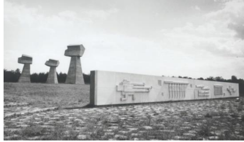
Fig. 7 The Bubanj Memorial Park (1963).