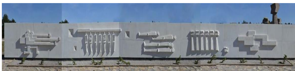
Fig. 8 The horizontal white marble bas-relief at the Bujanj Memorial Park, Niš