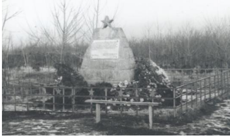
Fig. 6 The truncated stone pyramid, the first memorial to the Bubanj mass shooting victims (1950)

The first memorial to the victims of mass shootings at Bubanj execution grounds was a truncated stone pyramid (2.5m high), installed on 7 July 1950, at the initiative of the Association of Peoples' Liberation Army Veterans of the City of Niš. The inscription on the memorial plaque commemorates over 10,000 victims of Nazi terror from all parts of Serbia (Andrejević, 1975).