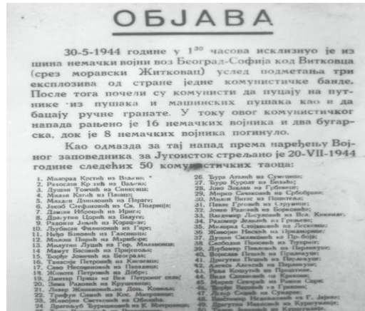
Fig. 3 Public Announcement of Feldkommandature 809-Niš: List of communist hostages to be shot in retaliation (July 1944).

The Concentration camp at Crveni krst Niš was officially liquidated on 14 September 1944. 4 In 1967, the former campgrounds were turned into the “12 th February” Memorial Museum, to commemorate the date of the first escape from a Nazi concentration camp in Europe. In 1979, it was declared a Cultural Monument of Exceptional Importance (EHRI, 2012). 5