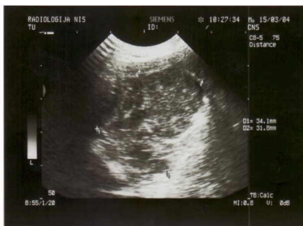
Fig. 1 Inhomogeneous, ill-defined, ultrasound appearance of ES of scapula (Case 1) measuring 34 x 31 mm.

patient was prepared and operated on. Resection of tumor along with the whole acromion and part of the scapula was performed with wide margins. Resected tumor measured 7 x 4 x 3.5 cm. On histology tumor was composed of small dense uniform round cells with round nuclei and scarce cytoplasm and the histopathology diagnosis was Ewing's sarcoma. Chest x-ray and CT scan didn't show pulmonary metastasis. The patient was then referred to the national oncology center where he received multimodal adjuvant chemotherapy. He was doing well for three years postoperatively. Then pulmonary metastases have been detected and he succumbed four years after surgery.