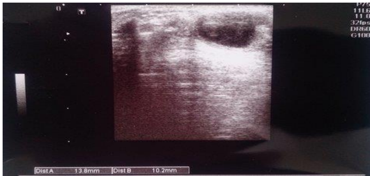
Fig. 2 Ultrasound of TGC, 21 years old female

CT and contrast CT (MSCT) may reveal a well circumscribed cystic lesion, 2–4cm in diameter with capsular enhancement [12].