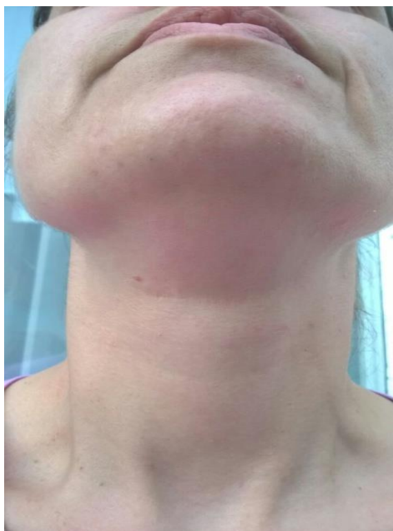
Fig. 4 Ten years after Sistrunk procedure for TGC in a young female, without recurrence and complication. Good cosmetic appearance

Although rare, multiple recurrences have also been reported usually requiring wider removal of tissue in the region of the remaining hyoid bone. Recurrence is the most common complication of treatment and is managed by central neck dissection.