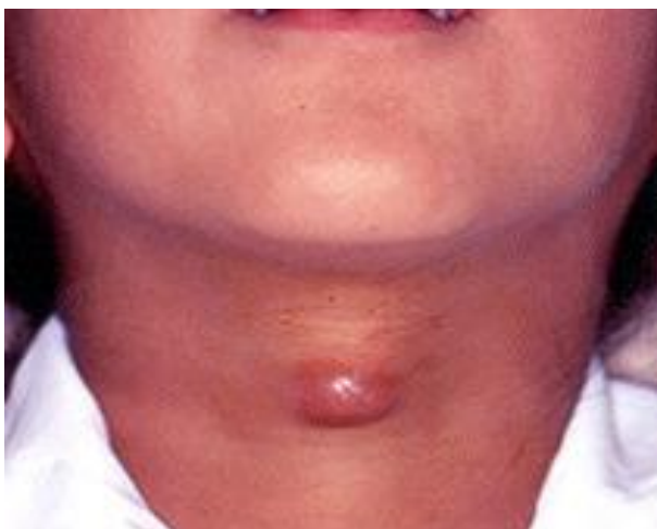
Fig. 3 TGC in 8 years old boy

Gioacchini et al. (2015) investigated 356 articles about TDGC and 24 were identified that satisfied selected criteria (a total of 1371 subjects) and concluded that a neck cyst mass is the main clinical presentation with a mean rate of 75%; that a most common