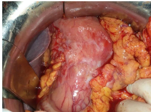
Fig. 1 Intraoperative view of advanced gastric cancer

T1 disease is present at >80% of gastric cancer patients and merely 40% of early gastric cancer are related to symptoms. Overall, 85% patients have lymph node metastases, 65% patients present as advanced cancers (T3, T4), and 40% are metastatic. Since this is a locoregional disease, the primary surgical aim is to remove the primary tumor with clear longitudinal and circumferential resection margin, with resection of associated lymph nodes and combined organ resection as required (R0 resection), following the restoration of intestinal and biliary continuity to allow adequate nutritional intake [6].