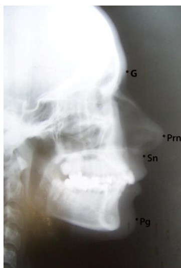
Fig. 2 The landmarks used in this investigation: glabella (G), pronasale (Prn), subnasale (Sn), pogonion (Pg).