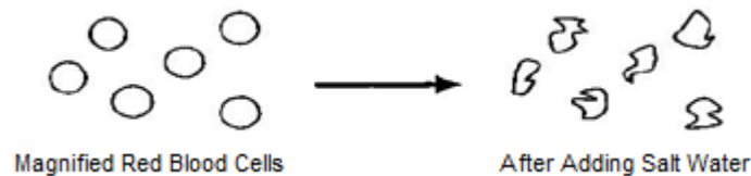
Fig. 2 Experiment 2

In order to examine these explanations, an experiment will be performed. It will be taken with water, a very precise instrument for measuring the mass and a plastic bag filled with water. It is assumed that plastic will act as a membrane in red blood cells. It is necessary to measure the mass of the prepared plastic bag, then immerse it in for ten minutes and re-measure the weight of the bag. What result of the experiment would best show that explanation 1 or 2 is probably wrong?