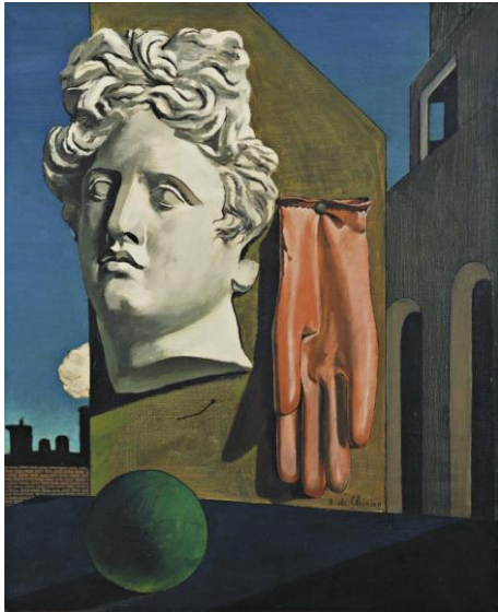
Fig. 3 Giorgio de Chirico, The Song of Love , 1914

Still, the most important representative and theoretician of metaphysical painting is certainly Giorgio de Chirico and Carlo Carrà and his book Pittura Metafisica (1919). By shifting the focus to what is “beyond physical reality”, starting with Nietzsche's philosophy de Chirico defined the main characteristics of metaphysical painting: on their canvases, metaphysical painters portray the mysterious, mystifying, surreal and metaphysical. Their paintings rarely depict human figures, rather they focus on the heroes of Ancient Greece. The architecture is simple and the Mediterranean cities are covered in glowing light. These characteristics of metaphysical painting are manifest in de Chirico's famous paintings The Song of Love (1914), The Great Metaphysician (1917).