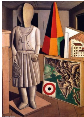
Fig. 5 Carlo Carrà, The Metaphysical muse , 1917