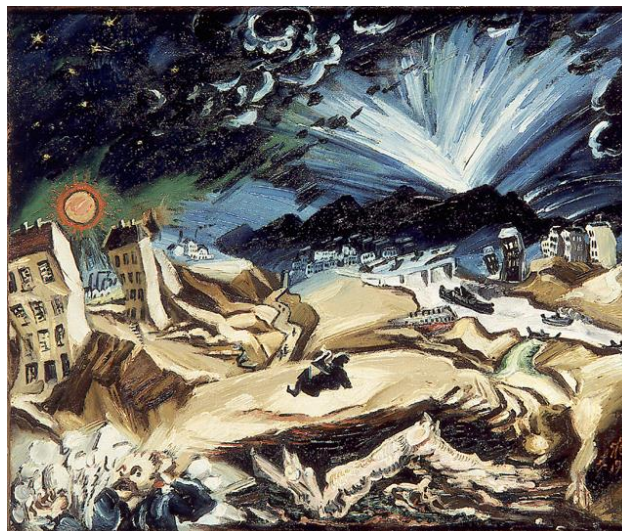
Fig. 2 Ludwig Meidner, Apocalyptic Landscape , 1913

We should also mention that as early as 1914, a German expressionist painter Ludwig Meidner, who we have already mentioned in our study The history of the term magical realism , attempted to portray inexplicable, dramatic and monstrous scenes of urban life. To make a long story short, Meidner, whose painting style was at first influenced by impressionism and post-impressionism and by the painting techniques of Amedeo Modigliani whom he had met in Paris in 1906, made a radical shift in his painting style and in the way he understood art and painting in general upon his arrival in Berlin in 1911. He joined painters such as Jacob Steinhardt and Richard Janthur with whom he founded the artists’ group Die Pathetiker in 1912. The themes that the artists in this group mostly focused on were technological development, urban life and suburbs shortly before World War I. Influenced by futurism, cubism and orphism, Ludwig Meidner took up the themes of man’s isolation in the big city, themes associated with the Apocalypse (for example, Apocalyptic Landscape , 1913), Great Flood and Last Judgment that we will deal with later, will be the dominant themes of magical realism in literature. Meidner himself called such a representation of reality fantastic, ardent Naturalism . That would in fact be a new movement within painting to soon appear carrying two different names: Magical Realism and New Objectivity (Kostadinović 2010, 117).