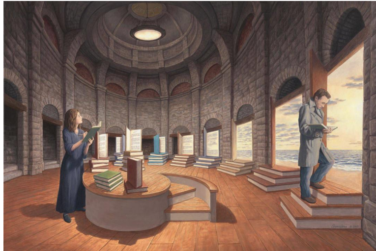
Fig. 7 Robert Gonsalves, The Space Between Words , 2004

In the end of this paper, we can highlight that magical realists are art illusionists. They manage to portray the illusion by changing the perspective in the mirror of reality, and this is achieved by using different painting techniques, literary, artistic and directing elements, in order to persuade the observers/readers that the mysterious and mystical found in the background of reality are actually based on empirical elements, and these are not only possible but rather very much probable.