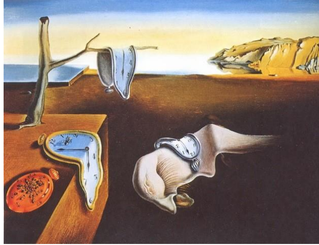
Fig. 6 Salvador Dalí, La Persistencia de la memoria , 1931

said that the premise of magical realism – to bring together the aspect of surrealism, as magical realism is such a paradox that is unified by the creation of narrative in which magic is incorporated seamlessly into reality“ (Bowers 2004, 2).