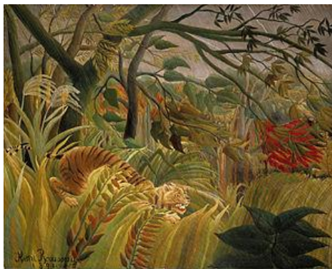
Fig. 1 Henri Julien Félix Rousseau, Tiger in a Tropical Storm or Surprise , 1891

By the end of the first and the beginning of the second decade of the 20th century, emerging from expressionist painting and evolving almost simultaneously with post-expressionism and surrealism, as a response to expressionism, a group of post-expressionist painters appeared. They were known as ein neuerer Realismus ( New Realism ), who used new and specific methods to portray the real world. In painting, the predecessor of such a representation of the real world is considered to be Henri Julien Félix Rousseau, a French painter in the naïve or primitive manner. Wassily Kandinsky believed that Rousseau's paintings marked the beginning of a new art movement – the movement that brings back realism and in which realism will be used to depict abstraction. 1 Henri Rousseau's contemporaries mocked him and said that his painting was child-like, nevertheless, they acknowledged his innovative technique. It is the somewhat naïve, childish style used in his paintings, which mainly portray luxuriant jungle scenes, as well as his use of rich colours and painting in layers beginning with a sky in the background and ending with animals or people in the foreground), with varnish and glaze as the end layer, that can be considered the predecessor of magical realism painting. These characteristics can already be seen in his early work, such as his famous painting Tiger in a Tropical Storm or Surprise (1891).