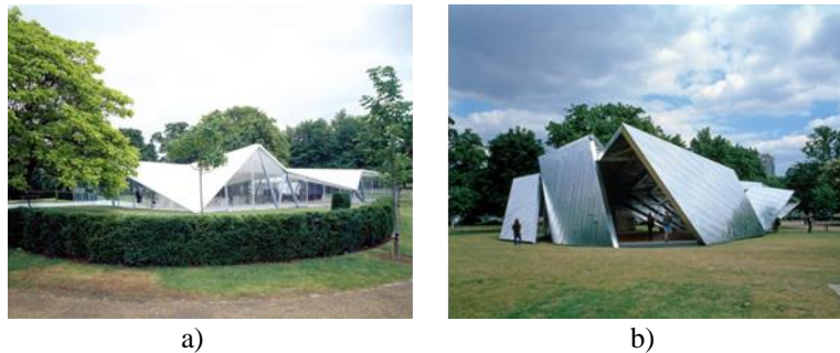
Fig. 3 (a) Personification of tents and origami, pavilions from 2000, (b) from 2001, successive

The development of the formalist approach is monitored through insights into the project from 2001, when Daniel Libeskind was hired for his creation. The Serpentine pavilion in 2001 is based on the idea of a flexible origami materialized in steel and reflecting aluminum panels (Fig. 3-b), which in the interior left the impression of more maze space than the space for people to stay and the presentation of works of art. His title "The Eightfold Turn" was a sculpture by itself, which establishes communication exclusively with the context of the park, reflecting the greenery over its polished envelope.