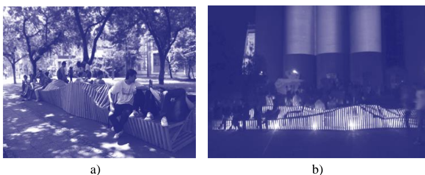
Fig. 2 (a) Bench 1000cm, (b) Bench 1000cm, night view (source: www.gradjanske.org/wp.../059-Otvoreno-o-javnim-prostorima.pdf , accessed: 12.03.2018)

grid that is attached to the frame of the wooden frames, and the entire construction is disassembled for easy transport. The advantages of such origami structures are the use of relatively small elements, which facilitates transport and reduces the cost of production, and their multiplication can be obtained by extremely dynamic compositions. In this way, a running, playful structure is obtained, suitable for sitting at different heights and in different positions. Due to the change in the level (Figure 1-b), from 20 to 90 cm high, this installation, in addition to the seating function, can also be used as a lectern. In this sense, the sculptural installation is an extremely flexible space, which functionally satisfies the needs of different groups of users. In addition, it also possesses visual qualities, enriching the urban - public space (open or closed). As for the name "forum" it refers to getting together, socializing, communion, sharing and debating ideas.