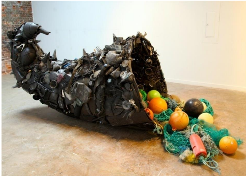
Fig. 2 Pamela Longobardi: Bounty, Pilfered , 2014. Fishing nets, floats and plastic parts on metal armature.