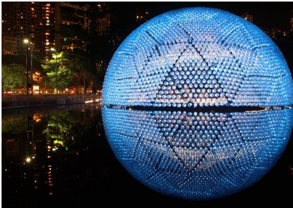
Fig. 9 Daydreamers Design Co. Rising Moon project, exterior view. Hong Kong, 2013. © Charles Chun Wai Lai.

In her 2011 work titled Soup (Fig. 8), part of the broader project Our Plastic Ocean , her images do have an impressively dual interpretation. They can remind to the viewers of sea animals, such as jelly fish and turtles, but also sea weeds and corals floating peacefully in dark sea water. On the other hand, they do reveal their real identity: their plastic waste origin which is both cruel and horrifying. Coffee-cups and lids, fishing nets, pieces of string, parts of bottles and toys, buttons and cotton-buds mixed together either forming a particular shape or in random, suspended in a dark nowhere, do stimulate spectators' minds and emotions with severely contradicting messages, which however can be impressively effective mainly as environmental pollution alert agents.