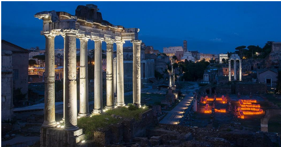
Fig. 5 Maria Cristina Finucci: Help the Ocean lit installation. Ancient Roman Forum, Rome, 2018.

Carried by currents and winds, marine plastic debris has created a gigantic, new ‘deadly ecosystem’ in the oceanic environment and especially in the sea around Italy. Keeping always in mind that art would be the only means that could have a direct impact on consumer consciousness, Finucci embarked on a glorious quest, in the framework of her great project, in order to face this disaster, applying just her art. Her primary, rough ideas were soon transformed into an ambitious installation, titled Help the Ocean, (The Age of Plastic) (Fig. 4). It consisted of more than five million brightly colored plastic bottle tops set in specific metal letter forms so as to spell out the word ‘Help’, manually assembled and weighed more than two tons in total. The monumental installation was impressively big so that it could be seen almost from everywhere, and symbolized humanity’s cry of despair to face the disastrous environmental issue of the sea pollution. There was no coincidence that it was first presented on the island of Mozia, off Sicily, in 2016, as both its coastline and Sicily’s greater region are literally plagued by the polluting power of plastic debris (Valeri 2016, 37).