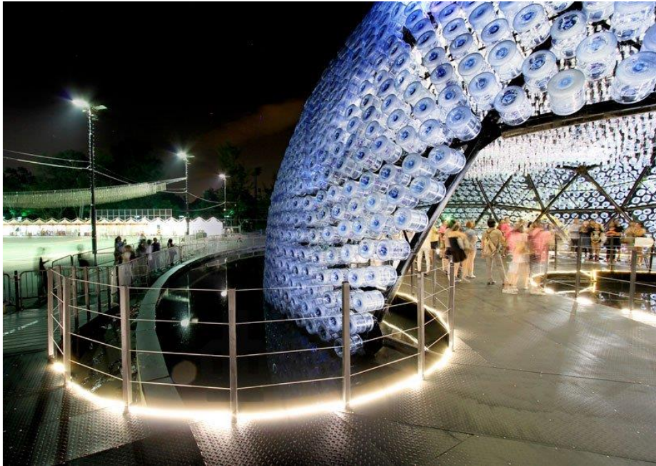
Fig. 10 Rising Moon , interior partial view. © Vincent Chi Hin Kar.

According to the century-old Chinese tradition, the celebration of the Mid-Autumn Festival was associated both with the harvest time and with the gathering of people with their families and friends once a year under the Autumn full moon which was considered the symbol of good crop and reunion (Nguyen 2003, 93). Daydreamers' Design 6 long-awaited project titled Rising Moon (Fig. 9). It was just a temporary construction, that managed to win the first prize of the competition as it was considered an original idea both culturally and ethically and it sensitively touched on Chinese traditions and at the same time promoted strongly the ecological problem of the area that was no other than the pollution of the South China Sea by plastic debris (Miao 2016, 59). The art installation in the form of an almost complete hemisphere, 20 meters in diameter by 10 meters in height, was made of thousands recycled, five-gallon water plastic bottles, sprayed in the tones of blue, green and red, which were carefully attached on a prefabricated metal structure composed of several triangle-shaped pieces. The bottles contained numerous LED lights which, when lit, gave to the bottles an ethereal, glowing effect which not only reminded of the traditional Chinese paper lanterns, but also reflected the vibrant Hong Kong city night life and culture.