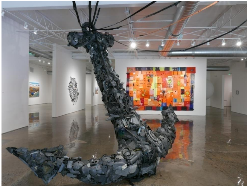
Fig. 3 Pamela Longobardi: Anchor (our albatross) , 2017. Urban and ocean plastic waste from Hawaii, Atlanta and Greece.