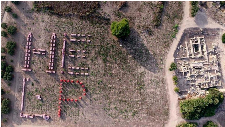
Fig. 4 Maria Cristina Finucci: Help the Ocean installation, Mozia island, 2016.

A similar outreach campaign, addressed mainly to the inhabitants of the Italian peninsula through art, and in particular large installations, has been launched by the Italian architect, artist and president of the great transmedia project ‘Garbage Patch State’, Maria Cristina Finucci since 2013.