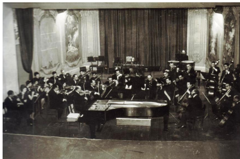
Fig. 7 The City Symphony Orchestra, 1962