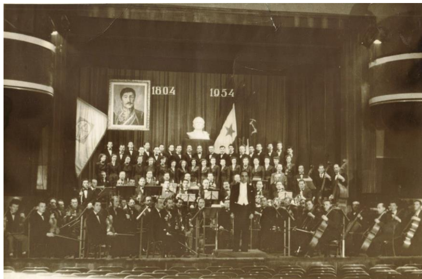
Fig. 1 Music Department (choir and orchestra) of the Niš National Theatre with conductor Ilija Marinković, 1954