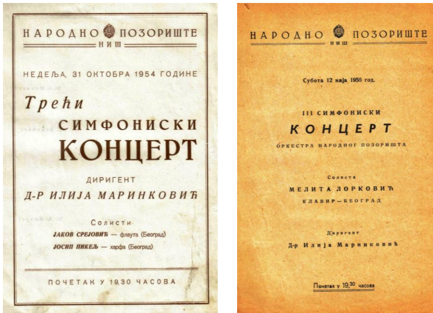
Fig. 2, 3 Concert programmes of the Music Department symphony orchestra, 1954, 1956