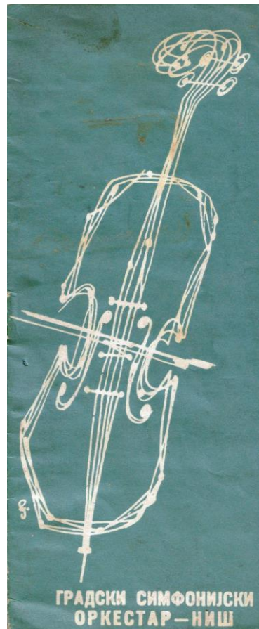
Fig. 8 Front page of the City Symphony Orchestra programme