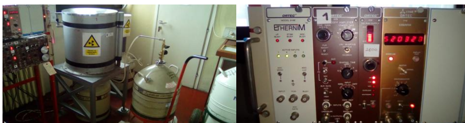
Fig. 3 High-resolution semiconductor HPGe detector "AMETEC-ORTEK" GEM50

Measurement of radionuclide activity in samples was performed using the high resolution semiconductor HPGe detector produced by "AMETEC-ORTEK" (Figure 3), with the energy resolution (FWHM, full width half maximum), from 1.78 keV to 1332 keV and the relative efficiency of 56.2%.