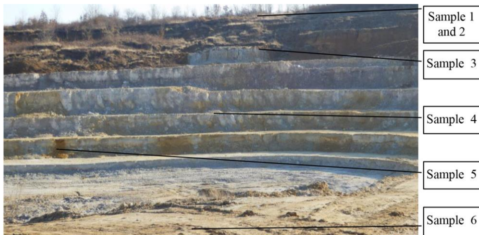
Fig. 2 The location of soil and clay sampling from the open pit "Zbegovi"

In the vicinity of the open pit "Zbegovi", from a 0.5 hectares meadow, which is located at the hillside above the pit (Figure 2), two soil samples were taken, from a depth of 30 cm and from a depth of 30-60 cm, respectively (Sample 1 and 2). Soil samples were collected using the IAEA method (International Atomic Energy Agency): Technical Report Series No.295 - Measurement of Radionuclides in Food and the Environment - Section 5. Collection and Preparation of Samples-page 27 (5.2.3 Soil) [11]. The next sample was taken from the soil layer at a depth of 10-15 m, i.e. from the mixture of the first layer of clay found in soil (Sample 3). Since the clay layer is not watertight, it is expected that this sample has increased radioactivity due to the accumulation of radionuclides that were vertically moving downward. The next clay sample was collected at a depth of 50 to 70 m (Sample 4).